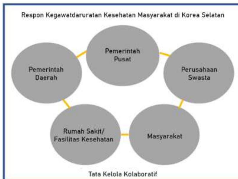
Figure 2. Collaborative Governance in Handling COVID-19 in South Korea adapted from Choi (2020)

South Korea—as well as China, Taiwan, and a number of other East Asian countries—had experience with SARS outbreaks in 2002 and H1N1 in 2009. In both outbreaks, poor conditions were mainly due to incompetent governments. In some countries, this is exacerbated by the lack of transparency and very few diagnostic tools for conducting tests. This then did not happen in South Korea. Based on experience in dealing with outbreaks, the public administration has also experienced adjustments and adaptations to support the acceleration of handling COVID-19. The Korea Centers for Disease Control and Prevention (KCDC) are at the forefront of handling this outbreak and are given space to access GPS information, financial data, and cellular activity data for tracing purposes. This is not the case in many countries due to privacy settings, lack of devices, lack of staff capable of performing these activities, and the like. Cellphone Tracking is also by CECC in Taiwan which allows early detection, including self-quarantine arrangements. So that things like people who are exposed to SARS-CoV-2 but have no symptoms can be active in the community and make it possible to transmit the virus to people who are more vulnerable, can be reduced.