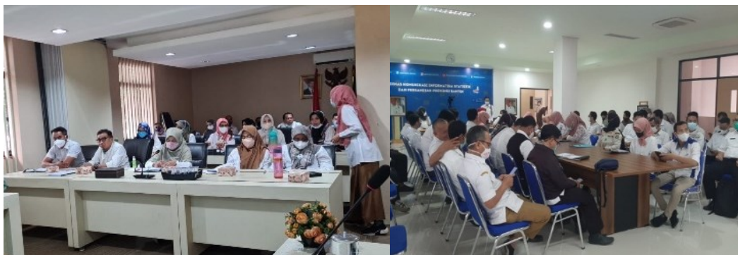
Figure 2. Technical Guidance for Improving the Capacity of PPID Apparatus in Banten Province (Left) and Technical Guidance on Preparing Public Information Lists and Exceptions to Public Information (Right)

Furthermore, to enhance technical skills, the Executive PPID of BPD Banten Province participates in Technical Guidance (Bimtek) activities within the Banten Provincial Government. These activities are conducted regularly. The communicative ability of the communicator is a fundamental aspect of every communication activity, including policy communication. The success of policy communication is determined by the communicator's ability to effectively engage. Communicators must master the technical qualifications in their respective fields to create an engaging impression in communication. This aligns with the communication psychology theory, which posits that the credibility of a communicator, partly determined by their expertise, serves as a benchmark for effective communicators (Laksana, 2015). Additionally, based on policy implementation models, the technical capabilities of human resources in policy implementation will support the success of the policy (Dunn, 2017). This is also consistent with previous research, which highlights that communicative techniques are essential for a communicator to influence the audience (Legarano et al., 2020).