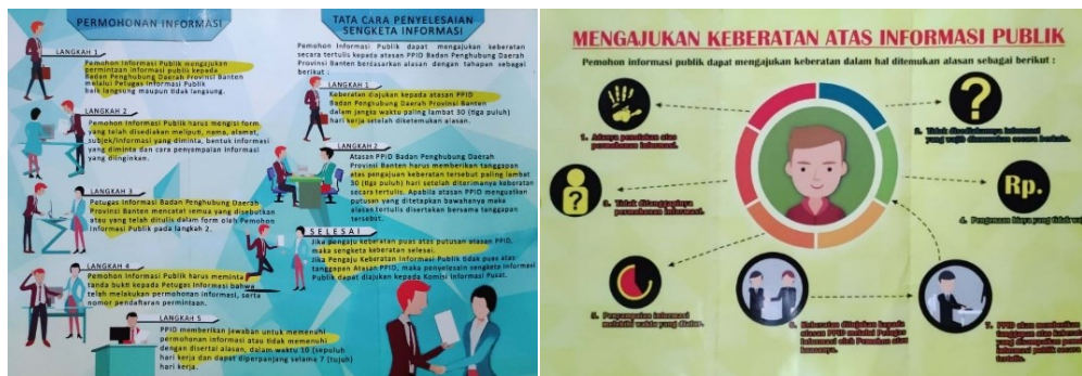
Figure 3. Brochure on the Procedure for Information Requests, Information Dispute Resolution, and Submission of Objections to Public Information at BPD Banten Province

Printed brochures are also used by BPD Banten Province as a communication medium to provide guidance on how to obtain information, how to resolve information disputes, and the procedures for submitting public information objections. These brochures serve as an informative tool, offering clear and concise instructions for citizens who need assistance with the public information request process or wish to address issues related to the transparency of government services. Through these various media, BPD Banten aims to ensure that the public has multiple access points for obtaining the information they need while also promoting transparency and accountability in the public sector.