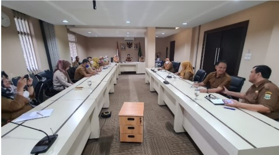
Figure 1. Socialization of the Executive PPID of BPD Banten Province with the Main PPID

Furthermore, to enhance technical skills, the Executive PPID of BPD Banten Province participates in Technical Guidance (Bimtek) activities within the Banten Provincial Government. These activities are conducted regularly. The communicative ability of the communicator is a fundamental aspect of every communication activity, including policy communication. The success of policy communication is determined by the communicator's ability to effectively engage. Communicators must master the technical qualifications in their respective fields to create an engaging impression in communication. This aligns with the communication psychology theory, which posits that the credibility of a communicator, partly determined by their expertise, serves as a benchmark for effective communicators (Laksana, 2015). Additionally, based on policy implementation models, the technical capabilities of human resources in policy implementation will support the success of the policy (Dunn, 2017). This is also consistent with previous research, which highlights that communicative techniques are essential for a communicator to influence the audience (Legarano et al., 2020).