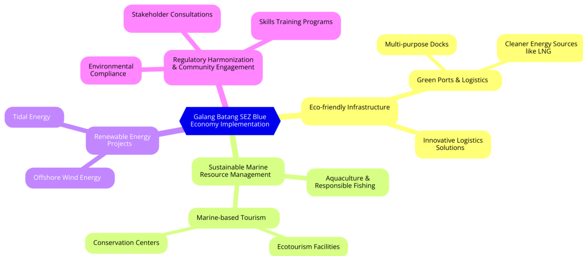
Figure 1. Mindmap Implementation

The implementation of the Blue Economy through strategic development at the Galang Batang SEZ (Special Economic Zone) involves integrating sustainable ocean-based economic practices with industrial and infrastructural growth. The Galang Batang SEZ's strategic location in the Riau Archipelago presents a significant opportunity to align its economic activities with Blue Economy principles, leveraging the coastal and marine resources sustainably. The focus includes developing eco-friendly infrastructure, enhancing marine logistics, and promoting industries such as fisheries, tourism, and renewable energy. These initiatives aim to not only drive economic growth but also preserve the marine ecosystem, ensuring long-term economic and environmental sustainability for the region.