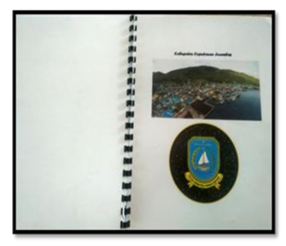
Figure 4. Fun Book Technology

After considering the problem above, Fun Book is the solution that is intended to develop the system of children's way of thinking so that their pattern of thinking is compatible with the method of education. The role of Fun Book as learning media is to combine the element of technology into an innovation. Hence, the effectiveness of previous and existing problems is possible to compare through some factors. The following is the specific explanations of how Fun Book really works and the result of testing that shows why it becomes an effective innovation and solution [7].