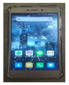
Figure 5. Display of Android HP

1. System software or Android is the media which is a must in employing Fun Book innovation since Android plays main role in processing Fun Book as the medium and connector to the application system.