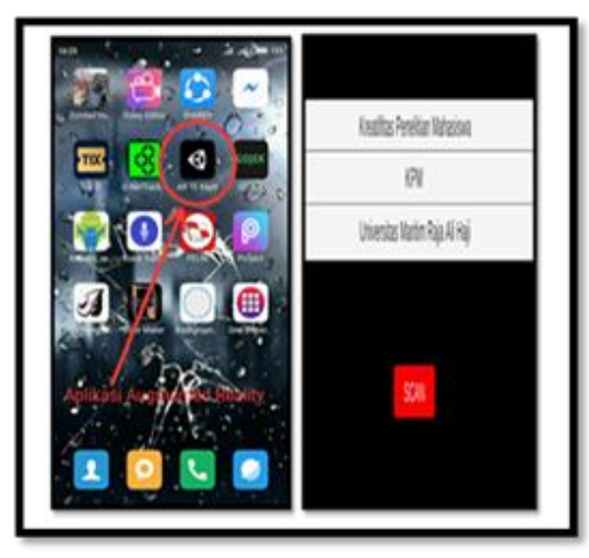
Figure 6. Augmented Reality Application

2. AR (Augmented Reality) is one the applications that can be used in many beneficial functions. Augmented Reality play an important role in Fun Book since Augmented Reality is capable for offering learning materials that have been programmed to be applied as education media for children [8].