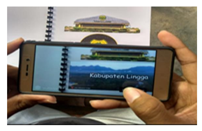
Figure 9. Augmented Reality Process

Then, if the logo has been scanned with AR application, there will show choices; Play and Stop. This menu will show because its barcode is sensitive as it is already programmed along with the application. After this step is done, there will show learning materials in the form of audio visual. It will show various explanations about the Regencies and the Cities in Riau islands. For example, there will show on the screen of the Android, that Bintan island has potential for attractive tourism and other related information.