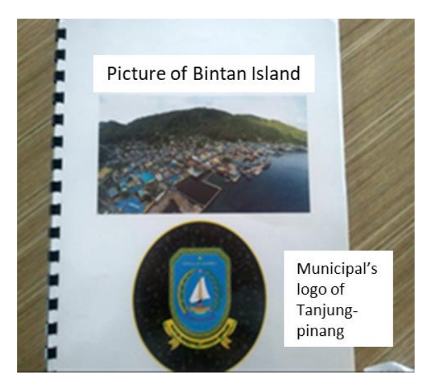
Figure 7. Fun Book

3. Books are the starting media to be used as media in this application. Both are combined as its working system is to scan a certain book as a learning book visual applied in this Fun Book innovation.