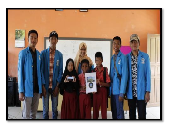
Figure 2. SDN 006 Gunung Kijang

M B Purnama et al., Journal of Innovation and Technology, April 2020, Vol. 1 No. 1. DOI: 10.31629/jit.v1i1.2134