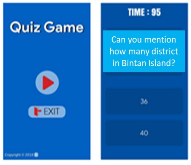
Figure 10. Quiz Game

Quiz Game is a supporting innovation in which it displays an application specifically designed for Fun Book innovation. This game has 2 main features, which are Play and Exit. Playing this game is just how to answer the problems provided in that Quiz Game application. The problems asked are everything about Fun Book innovation. Quiz Game has nominal time to think at each 10 main questions. The time given is 100 seconds. Each problem scores 10 and 100 for the whole points. Quiz Game is very influential in testing the effectiveness among elementary school students to memorize and comprehend Fun Book innovation and as an education media and a solution for helping student's intellectual, as concluded in somewhere else [10].